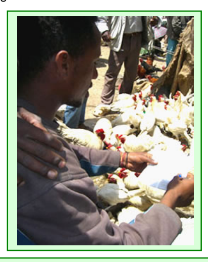
Figure 4: A good example of niche marketing was found in the Dessie Monday Market. This poultry trader had bought white chickens from farmers to resell at the market. In May, many people in the area perform a traditional ceremony that involves circling a white bird around their head and then slaughtering it. It is believed that this practice will pass illness and bad luck to the bird so that the people will have a good year ahead. (This same trader lost approximately ETB 4,000 around Easter time because of people refusing to eat chickens because of the avian flu scare. He also said that many farmers killed their 'ferengi' birds [i.e. the RIR birds] because they were scared that they carried avian flu. The sale of birds was improving but the price remains lower than before the avian flu scare.)

Newcastle disease (ND), called Fengil in Ethiopia, is reported to be the most important cause of economic loss in poultry production. The recent false alarm about an avian flu outbreak also caused huge economic loss to the producers of both commercial and indigenous birds.