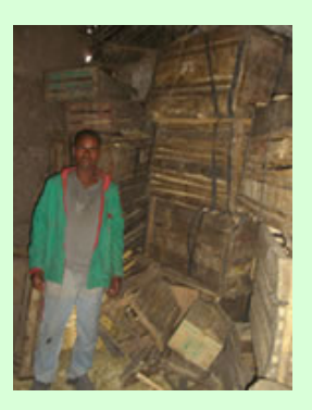
Figure 3: Dessie City has a number of egg traders. These traders buy eggs from farmers, package them in homemade crates and transport them to Addis Ababa for sale. The eggs are packed using straw but, despite this precaution, some eggs are broken in transit.