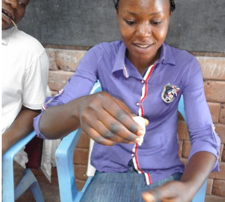
Attendees at the first DRC training program lead by Dr Mwabi

The good news is that there is much interest in vaccination with many people in outlying villages wanting to know how they can get involved.